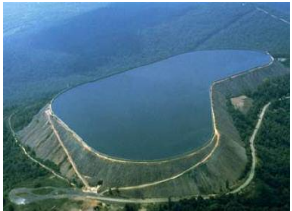
Figure 5-3. View of upper Reservoir, prior to the breach.