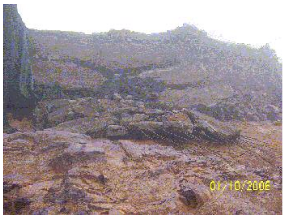
Figure 5-4. View of bedrock immediately below failed embankment section. Note weathered clay in lower portions of the exposure.