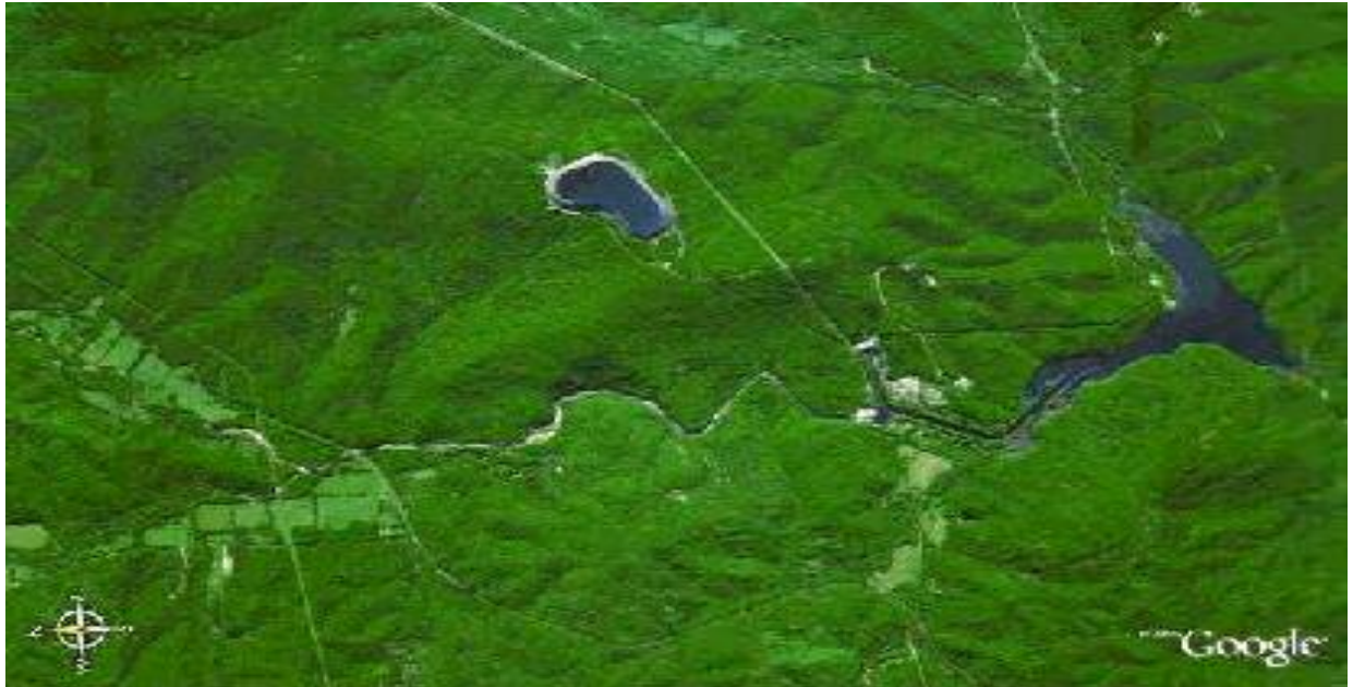
Figure 1-2. Pre-event satellite photograph showing the upper and lower reservoir, the powerhouse and the East Fork Black River along the Johnson Shut-Ins State Park.