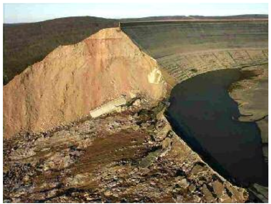
Figure 5-6. Weathered rock and discontinuous clay seam foundation just downstream of fish-pond area.