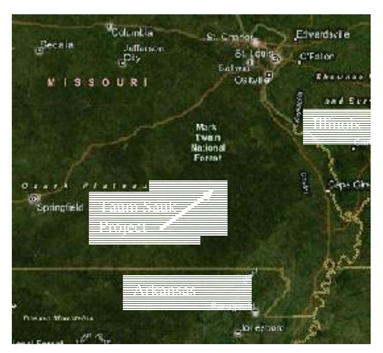
Figure 1-1. General location of the Taum Sauk Project within the State of Missouri.