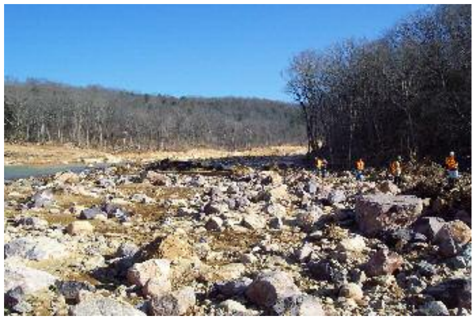
Figure 5-8. Looking upstream from debris dam.

A break in the slope of the terrain is located on Ameren property, just within the boundary line with Johnson's Shut-ins State Park at the lower portion of the mountain. Most of the deposition of eroded sediments and rock fill from the dam embankment occurred at this point, forming a debris dam (Figure 5-8) and pond at the approximate location of U.S. Geological Survey gage station (No. 070661270) which was severely damaged during the event. The material deposited at this point ranged from boulders several feet in diameter to sand and fine silts. Concrete, rebar, and sections of the geomembrane lining from the Upper reservoir were also present in the debris field, thus creating a new soil deposit in this area.