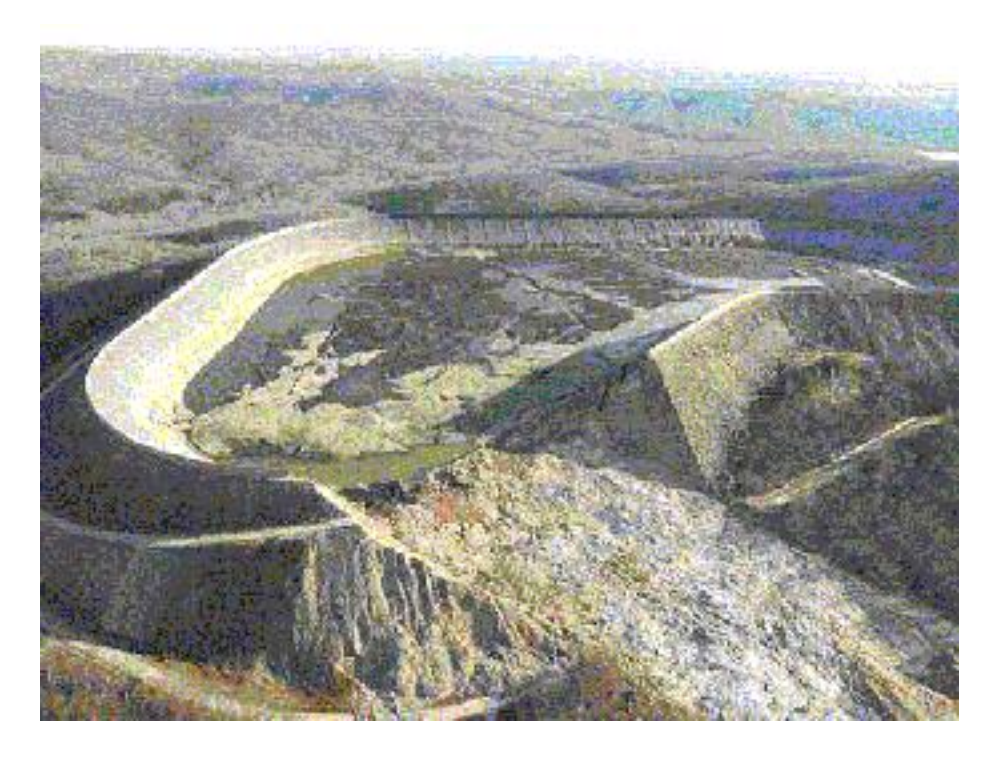
Figure 5-5. View of bedrock within, and immediately below failed embankment section. Note distribution of weathered rock (red-brown color) and topsoil (green-brown color).