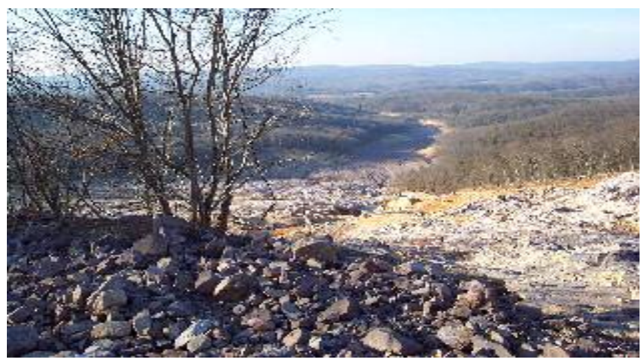
Figure 5-7. Downstream view from breach.

A break in the slope of the terrain is located on Ameren property, just within the boundary line with Johnson's Shut-ins State Park at the lower portion of the mountain. Most of the deposition of eroded sediments and rock fill from the dam embankment occurred at this point, forming a debris dam (Figure 5-8) and pond at the approximate location of U.S. Geological Survey gage station (No. 070661270) which was severely damaged during the event. The material deposited at this point ranged from boulders several feet in diameter to sand and fine silts. Concrete, rebar, and sections of the geomembrane lining from the Upper reservoir were also present in the debris field, thus creating a new soil deposit in this area.