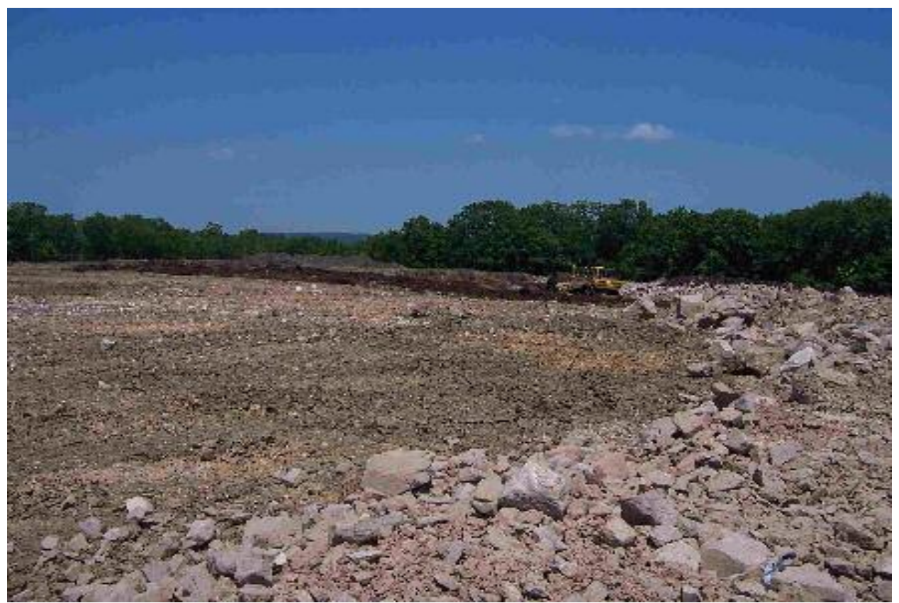
Figure 5-10. Preparation of Laydown Area 1. The fill material from the upper reservoir (sediment and concrete debris) was used to level the site. A hardfill cap will be placed over the top of the area.

The disturbance of these areas will create the potential for soil erosion, however, these areas would be mitigated by the implementation of the proposed Erosion Control Plan described in section 3.2.2.1 and the use of Best Management Practices to control erosion during construction. Examples of best management practices include the use of