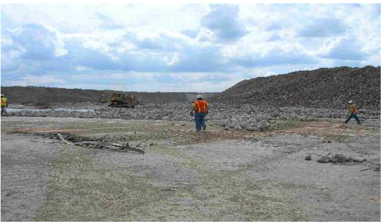
Figure 5-9. Drained upper reservoir basin showing the rockfill materials after removal of the concrete face panels.

The licensee's proposal to reuse the material comprising the existing rockfill dam by processing the material through a crushing plant. This processed material would comprise the aggregate utilized in a RCC hardfill dam (Figure 5-9).