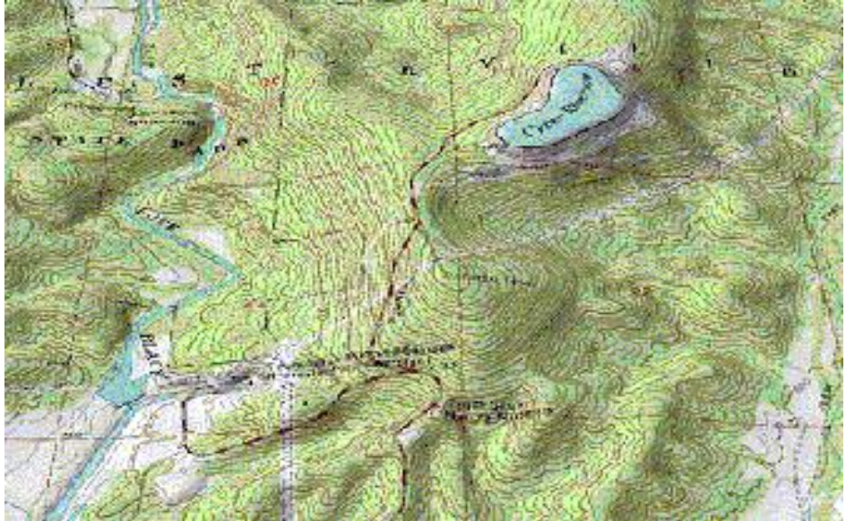
Figure 5-2. Shaded topographic map of project.