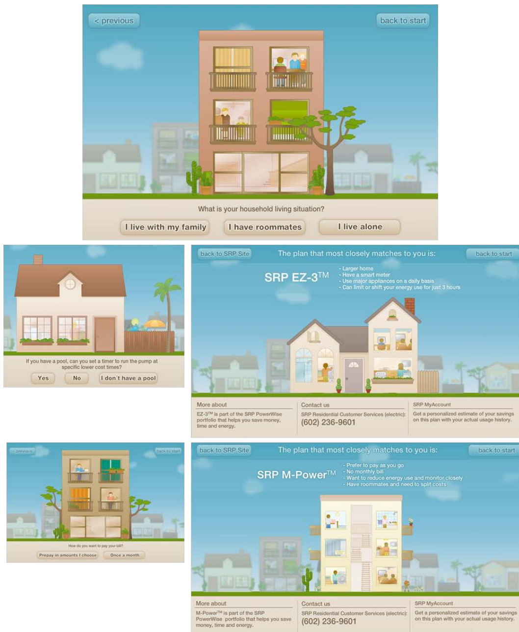
Figure 4: SRP has put tools in place to measure people visiting the interactive application. As of March 2012, it was averaging about 3,300 unique customer visits a month. Feedback has been very positive.

“We’ve started doing more online community research, where we have an ongoing dialogue with our customers on a specific topic. We also use a lot of secondary research sources including the J.D. Power research, E-Source and Chartwell.”