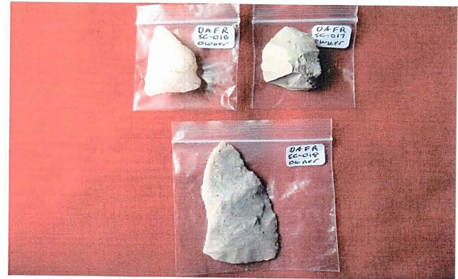
Unidentifiable Paleo Knife Blades 13,000 – 8,000