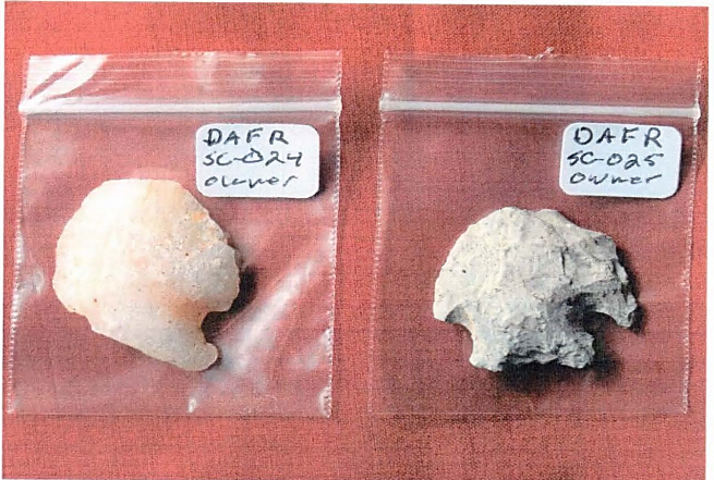
Kirk Corner Notched Points Earl/Mid-Archaic 9,000 – 6,000 BP