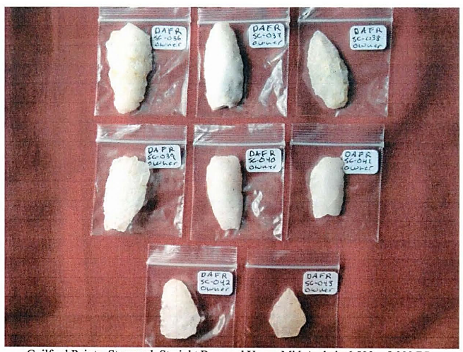
Guilford Points, Stemmed, Straight Base and Yuma, Mid-Archaic 6,500 – 5,000 BP