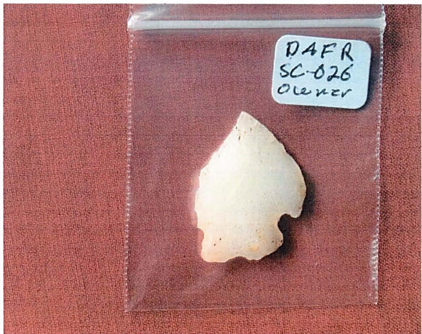
Decatur Point Early/Late Archaic 9,000 – 3,000 BP