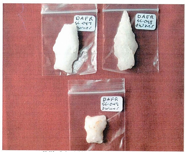
Halifax Points Mid/Late-Archaic 6,000 – 3,000 BP