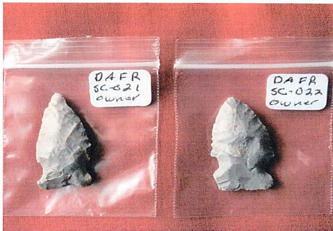
Taylor Points Early/Mid-Archaic 9,000 – 6,000 BP