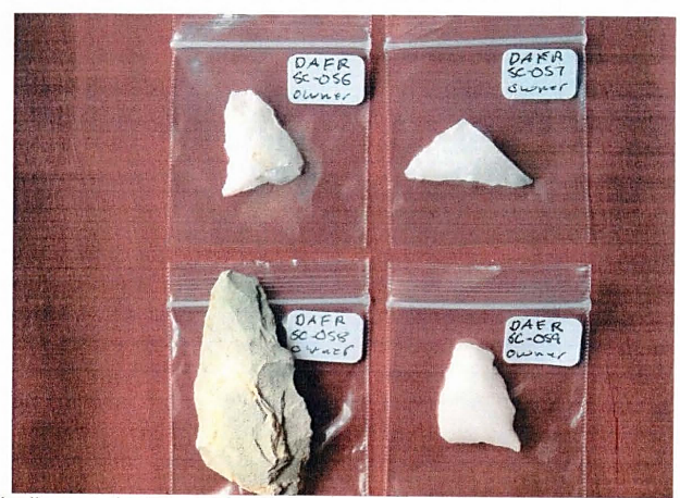
Miscellaneous Point fragments and Knife Blades spanning the Archaic Period 9,000 to 3,000 BP