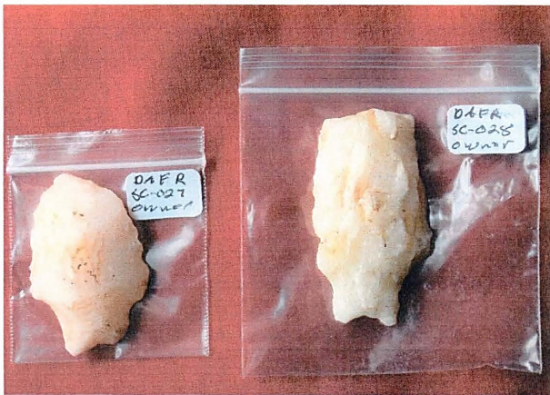
Stanley Narrow Base Points Early/Mid-Archaic 8,000 – 5,000 BP