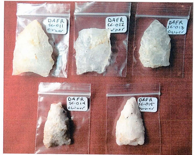
Hardaway Blades, Paleo Period, 9,500 – 9,000 BP