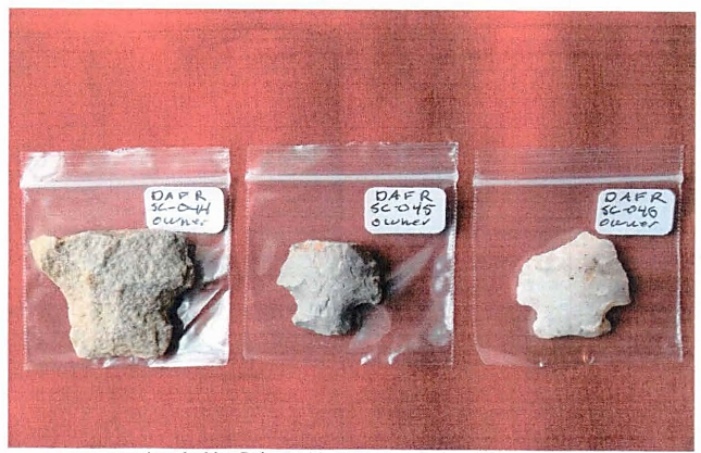
Appalachian Points Mid/Late-Archaic 6,000 – 3,000 BP