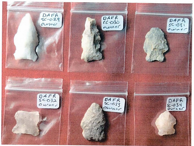
South Hampton Points Early/Mid-Archaic 8,000 – 6,000 BP