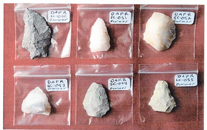
Miscellaneous Point fragments and Knife Blades spanning the Archaic Period 9,000 – 3,000 BP