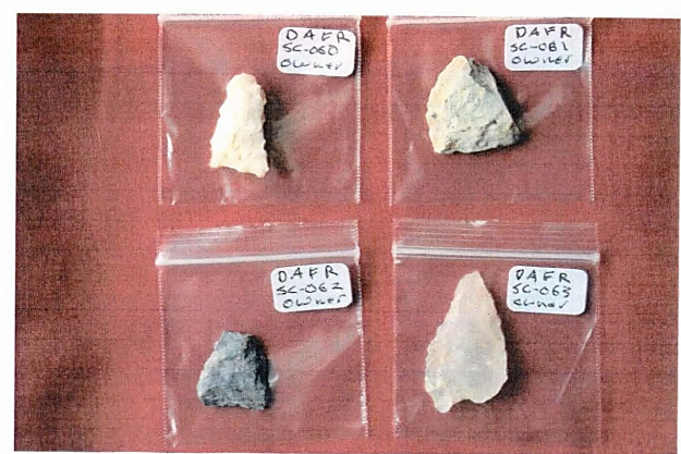
Miscellaneous Point fragments and Knife Blades spanning the Archaic Period 9,000 – 3,000 BP