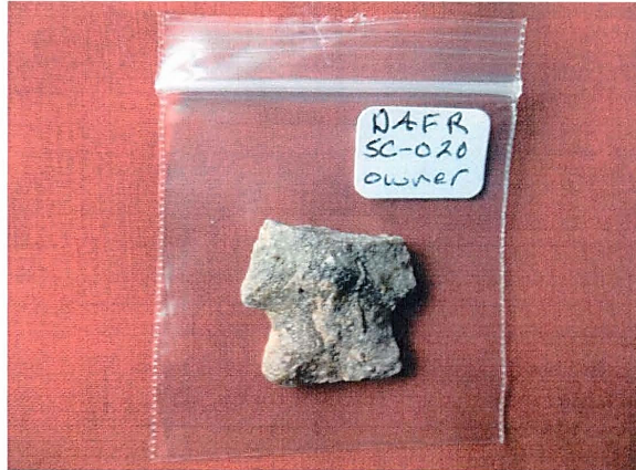
Jude Point Early/Mid-Archaic 9,000 – 6,000 BP