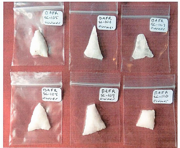
Caraway Points Woodland Period 1,000 to 200 BP