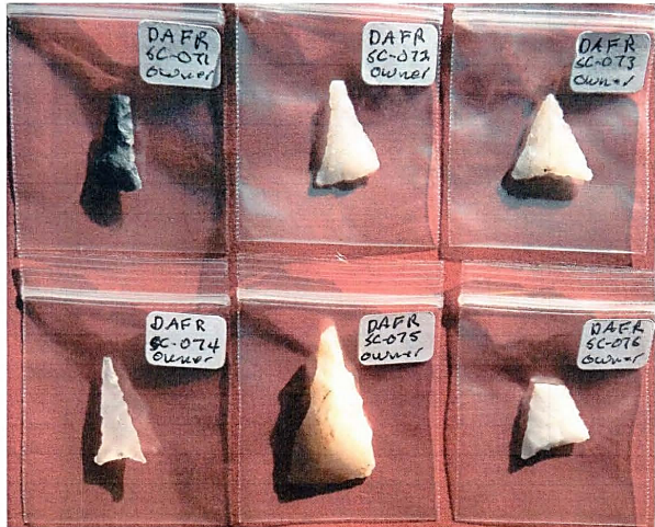
Uwharrie Points Woodland Period 1,600 to 1,000 BP