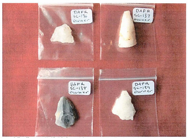
Miscellaneous Knife Blades and fragments Woodland Period 2,500 to 550 AD