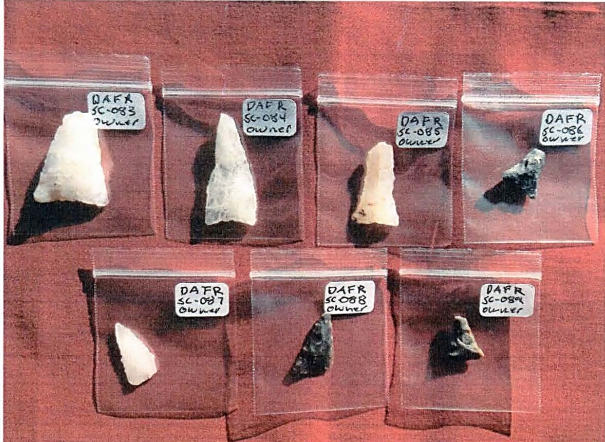
Uwharrie Points Woodland Period 1,600 to 1,000 BP