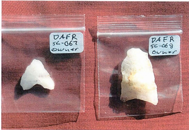
Yadkin Points Woodland Period 2,500 to 500 BP