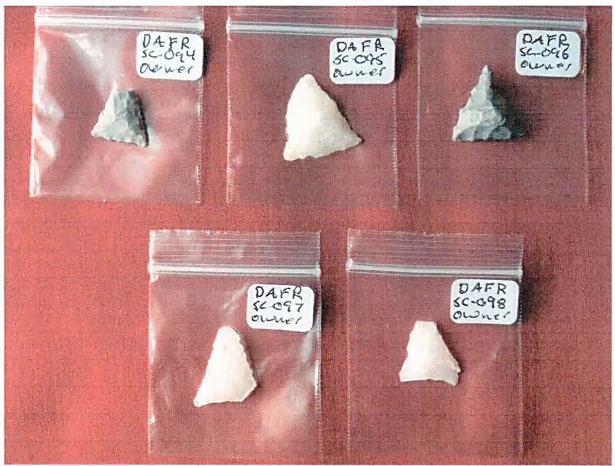
Clarksville Points Woodland Period 1,000 to 500 AD