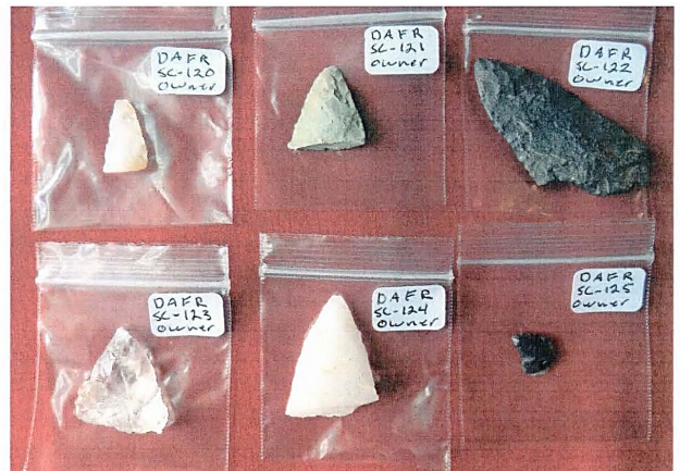
Miscellaneous Knife Blades and fragments Woodland Period 2,500 to 550 AD