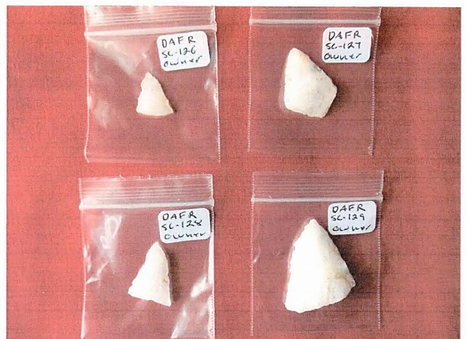
Miscellaneous Knife Blades and fragments Woodland Period 2,500 to 550 AD