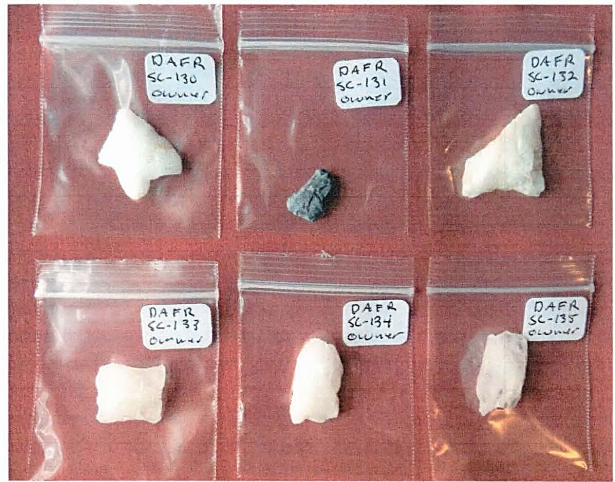
Miscellaneous Knife Blades and fragments Woodland Period 2,500 to 550 AD