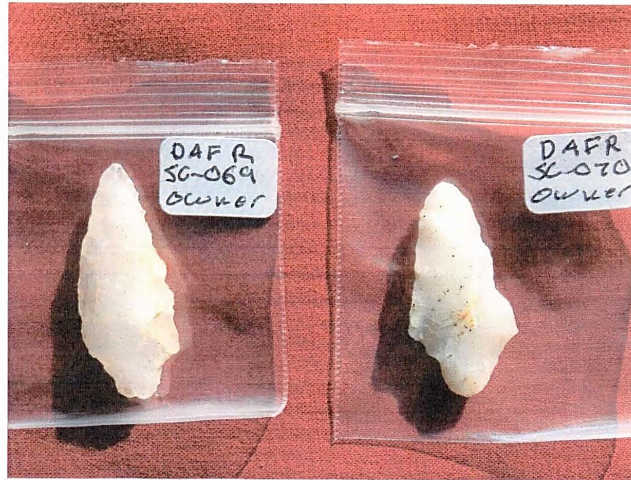
Piscataway Points Woodland Period 2,500 to 500 BP