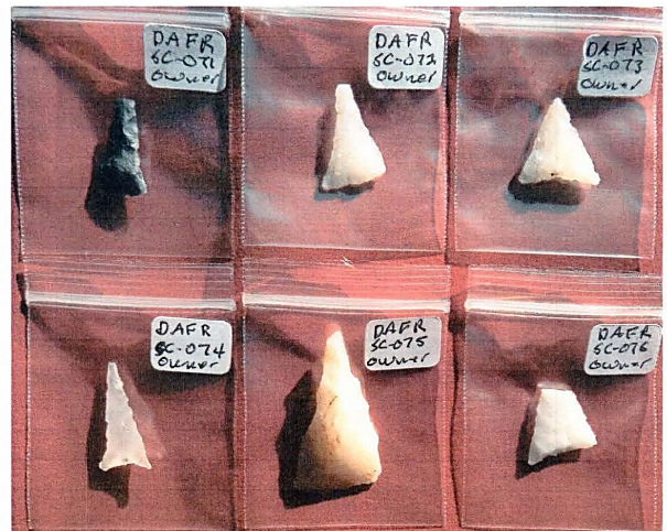
Uwharrie Points Woodland Period 1,600 to 1,000 BP