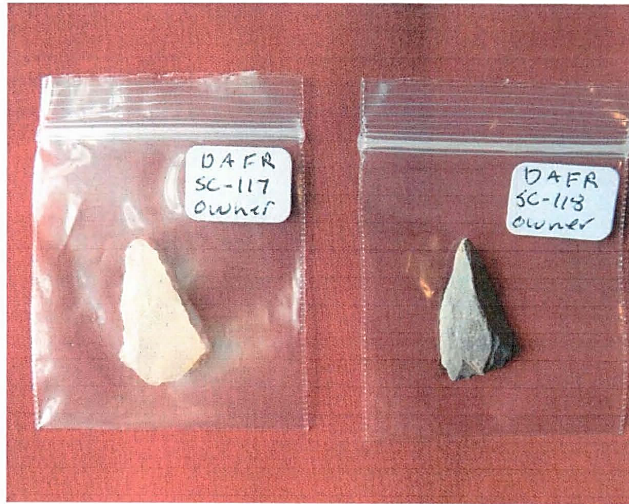
Caraway Points Woodland Period 1,000 to 200 BP