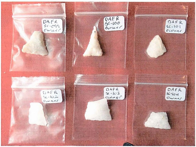
Caraway Points Woodland Period 1,000 to 200 BP