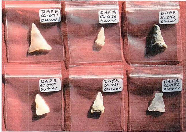
Uwharrie Points Woodland Period 1,600 to 1,000 BP