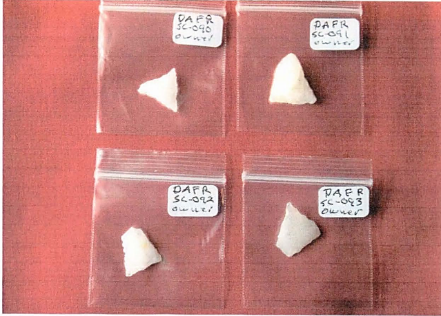
Clarksville Points Woodland Period 1,000 to 500 AD