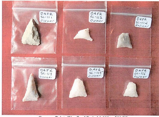
Caraway Points Woodland Period 1,000 to 200 BP