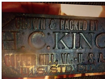
Figure 12 - Harry C. King's orchard hand-stamp used for apple crates