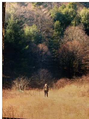
Figure 10 - Lois King Waldron in her orchard