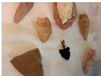
Figure 11 - artifacts collected by Lois King Waldron and her children

20161222-5151 FERC PDF (Unofficial) 12/22/2016 12:06:15 PM