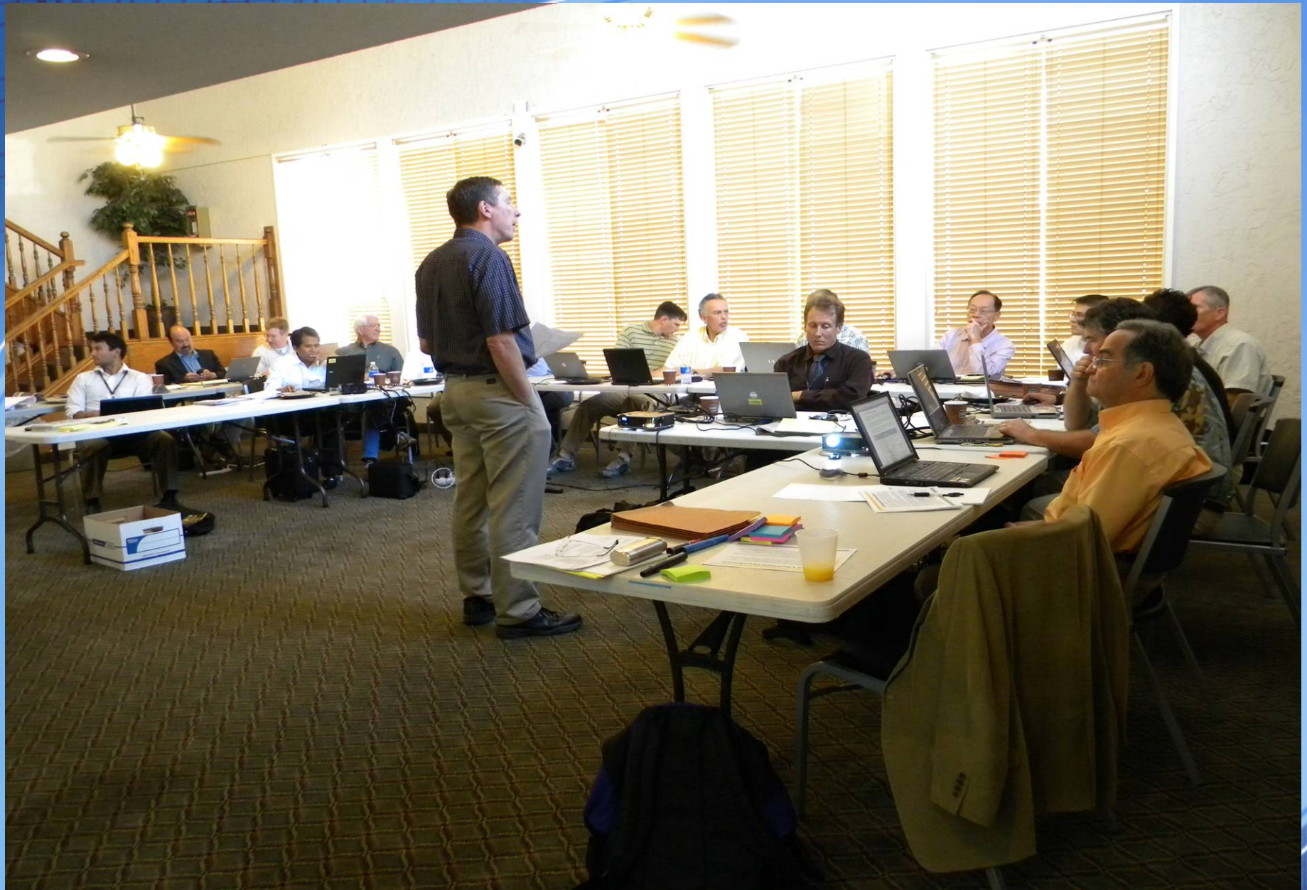
The Team at Work