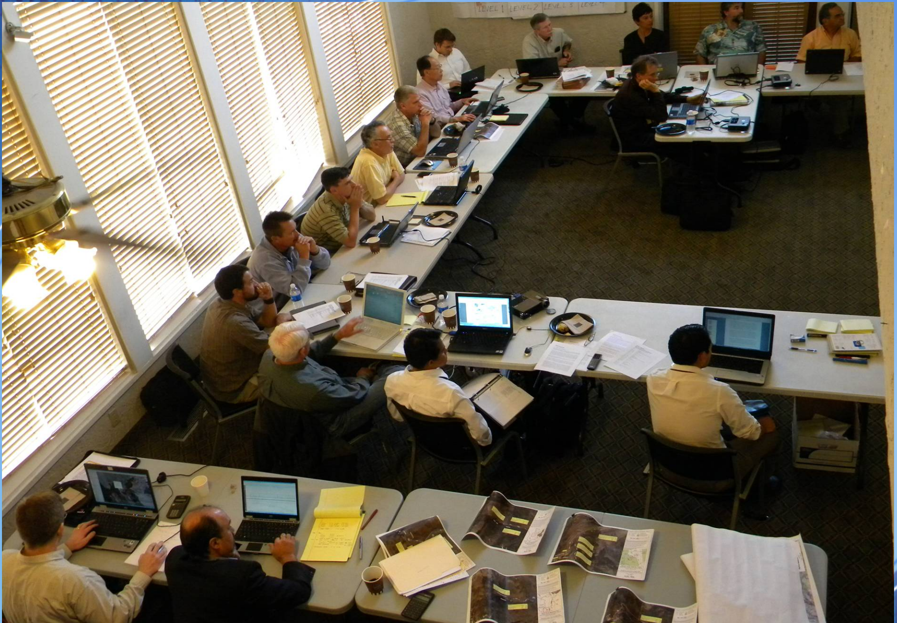
The Team at Work